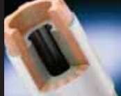
A unique die cast copper rotor design is one of the key elements that enable Siemens Ultra Efficient motors to exceed NEMA Premium® efficiency standards.